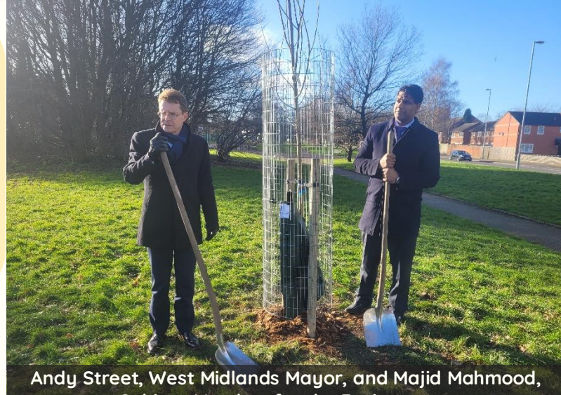
Cabinet Member for the Environment

Representatives from the Mayor's Office, WMCA, Treeconomics, Amazon, Birmingham City Council (including the Parks Team, who have helped us throughout our planting) were all in attendance for this wonderful event, and the mayor learned how to plant a tree firsthand!