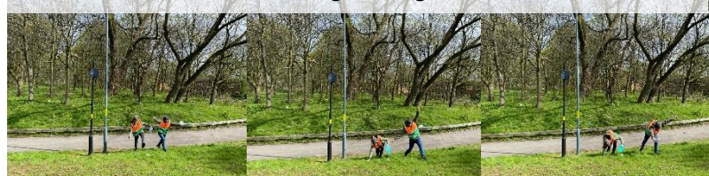
The Ministry of Silly Walks!