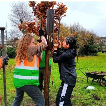
A picture of the group with the first tree planted that day!