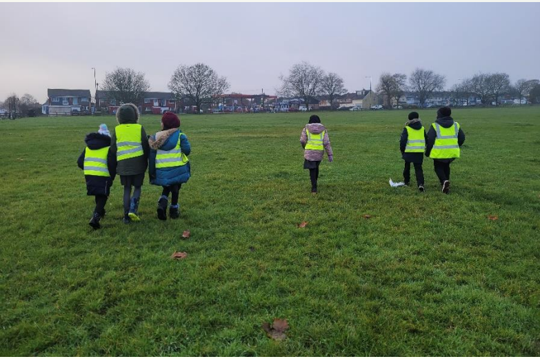
The pupils from Highters Heath Community School running across the field of Daisy Farm Park to the planting site!